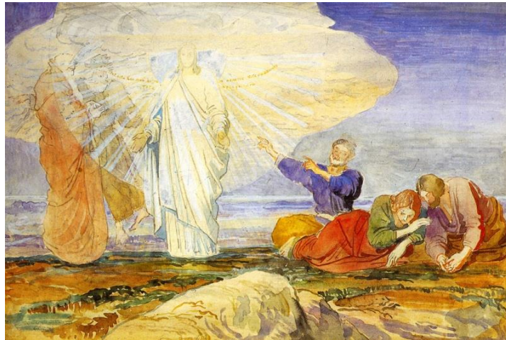
Transfiguration by Alexandr Ivanov, 1824

Violet cloth, Lectionary, a candle, and an icon of Jesus