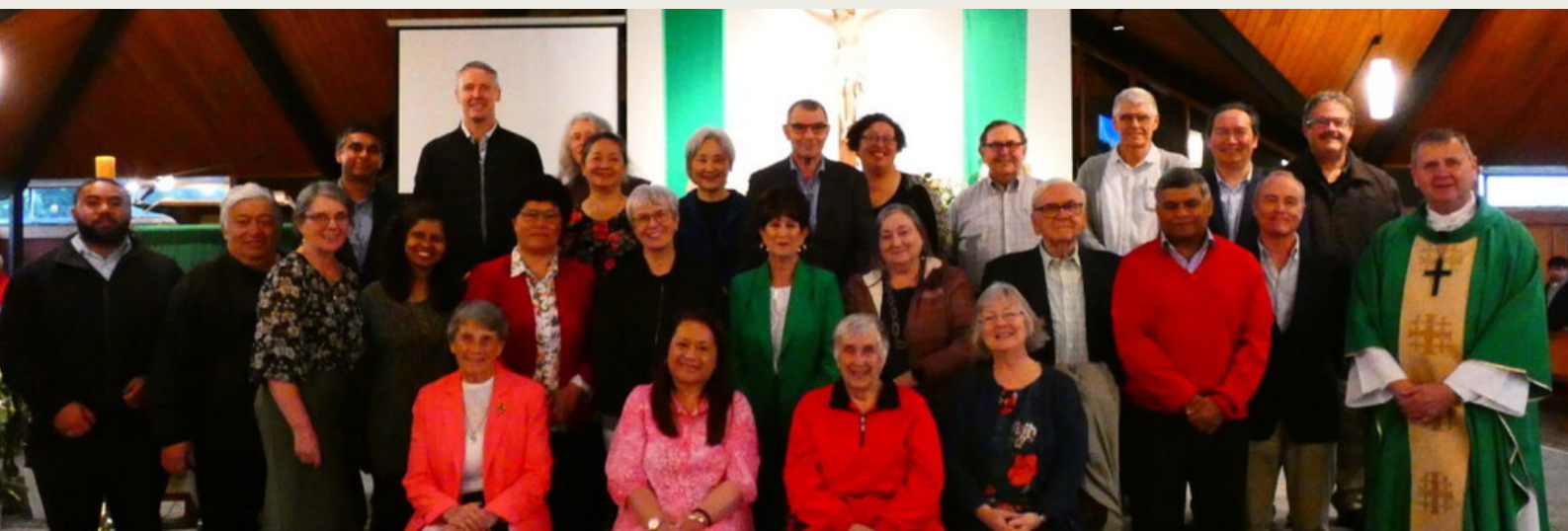
Current and past DPC members who were able to attend the Mass.