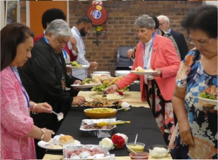
DPCers past and present