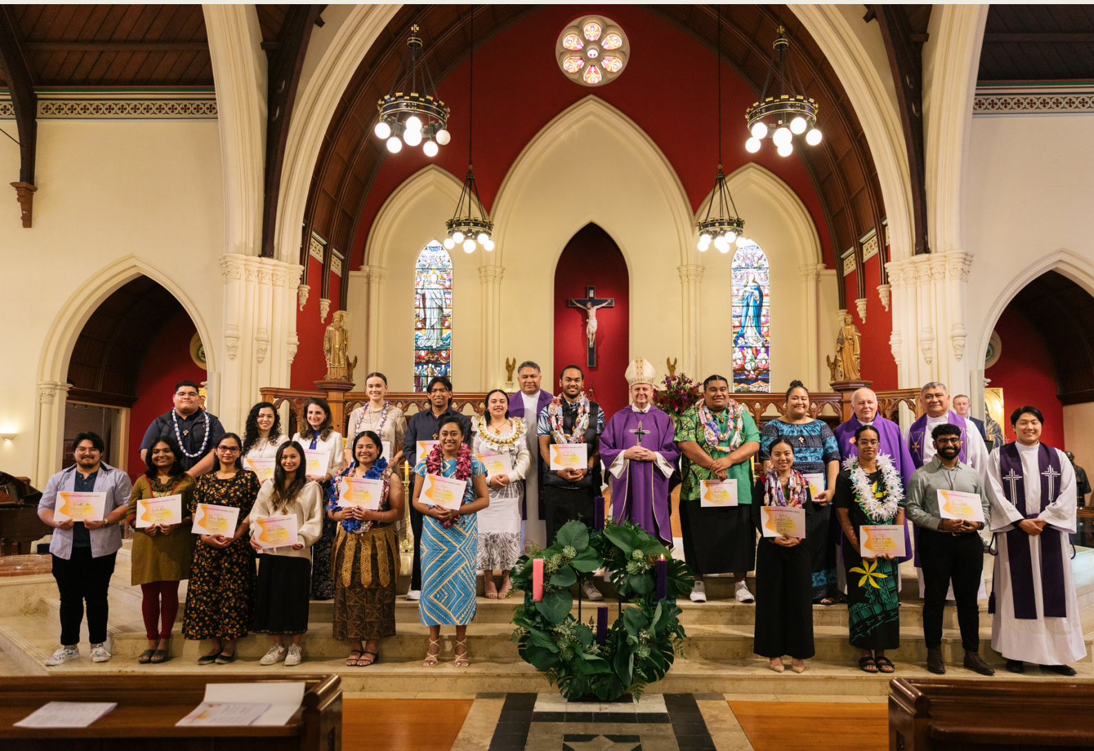
Tu Kahikatea Award recipients for 2023.