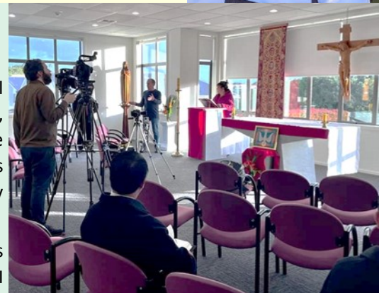
Seminarians and staff preparing for the recording of the Shine TV Mass. Seminary chapel.